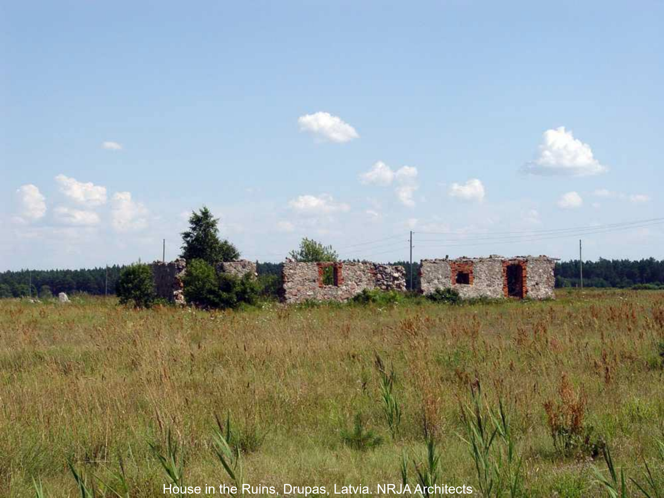
House in the Ruins, Drupas, Latvia. NRJA Architects