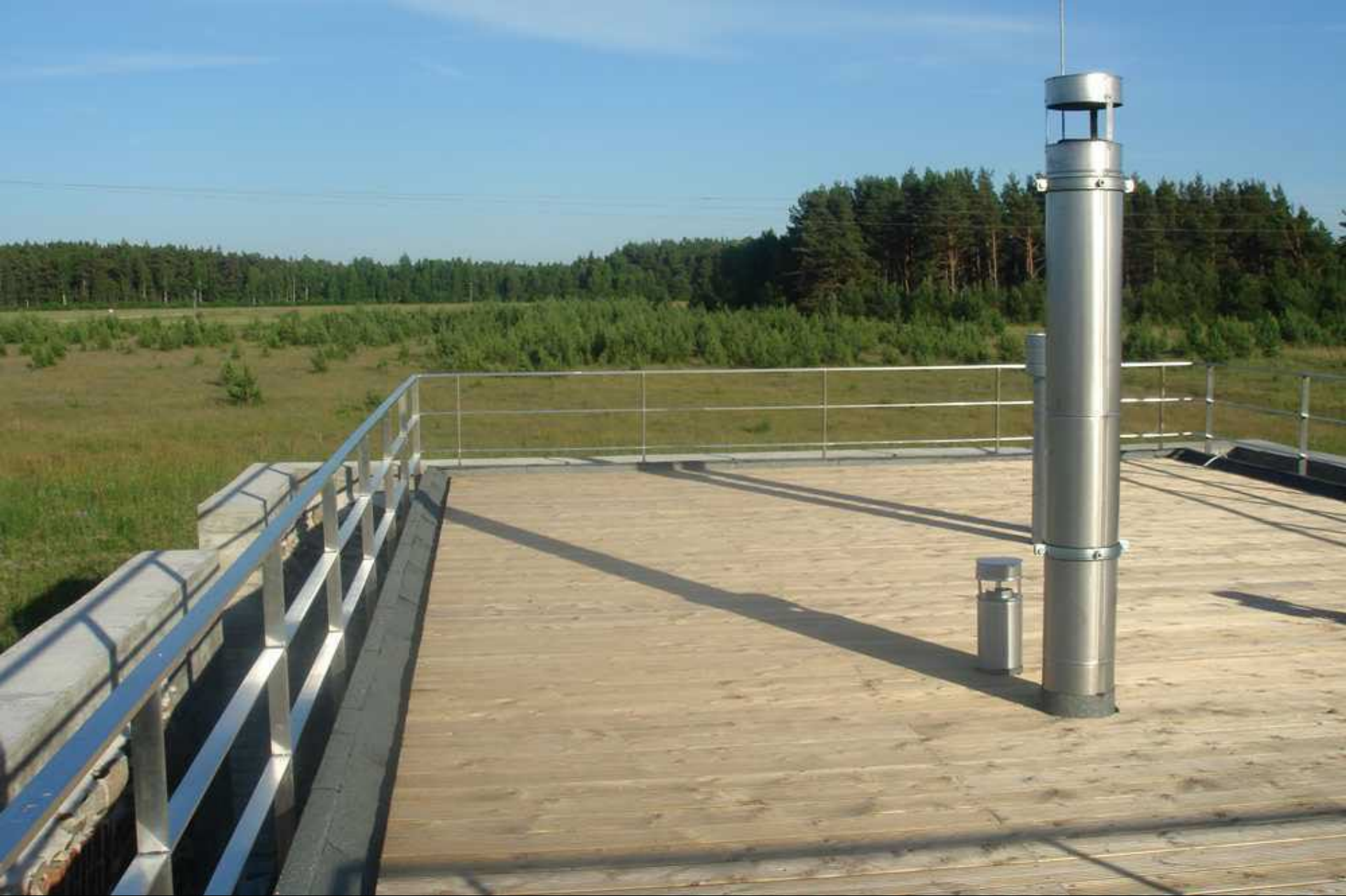
House in the Ruins, Drupas, Latvia. NRJA Architects