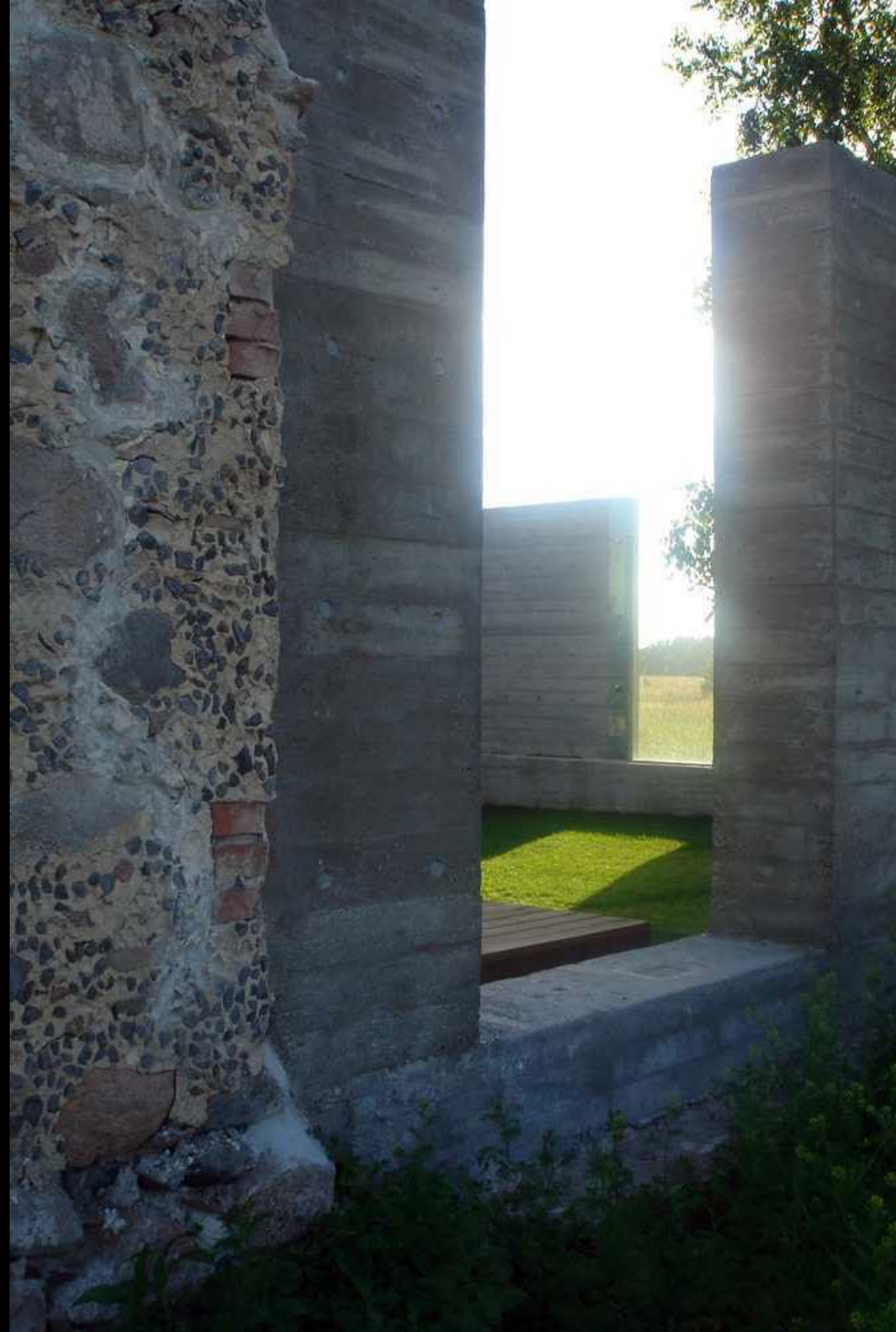
House in the Ruins, Drupas, Latvia. NRJA Architects