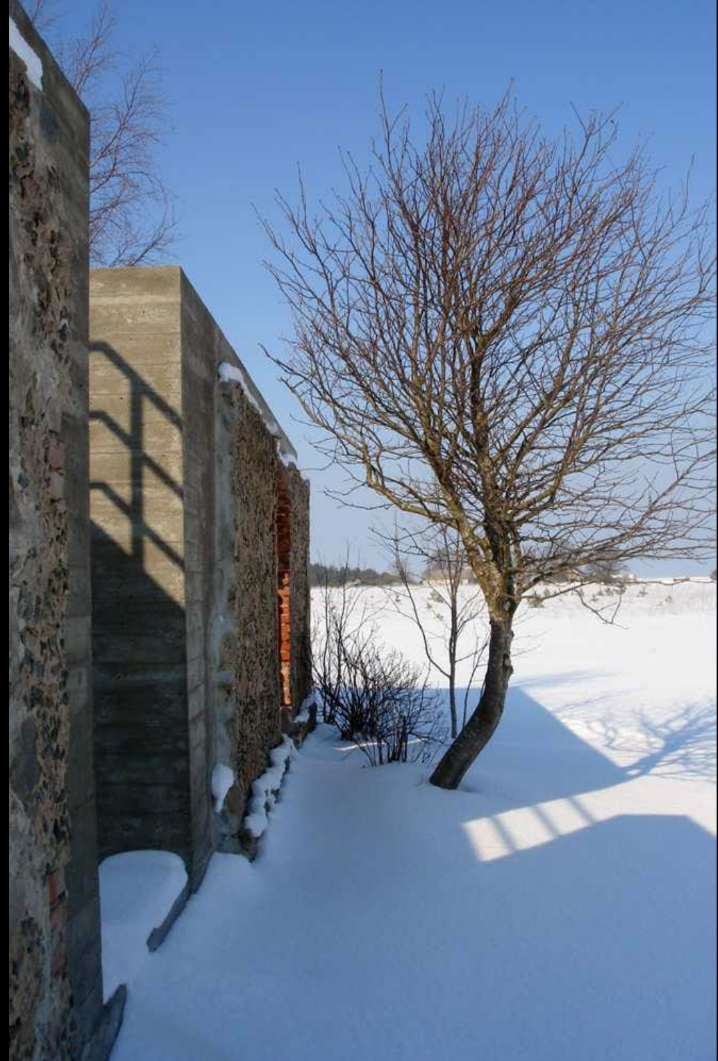
House in the Ruins, Drupas, Latvia. NRJA Architects