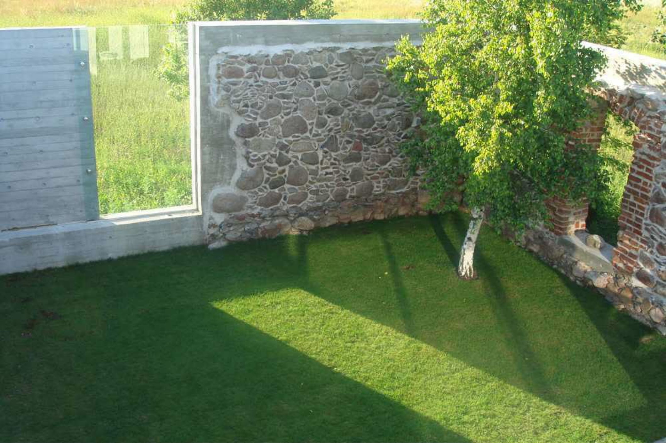
House in the Ruins, Drupas, Latvia. NRJA Architects