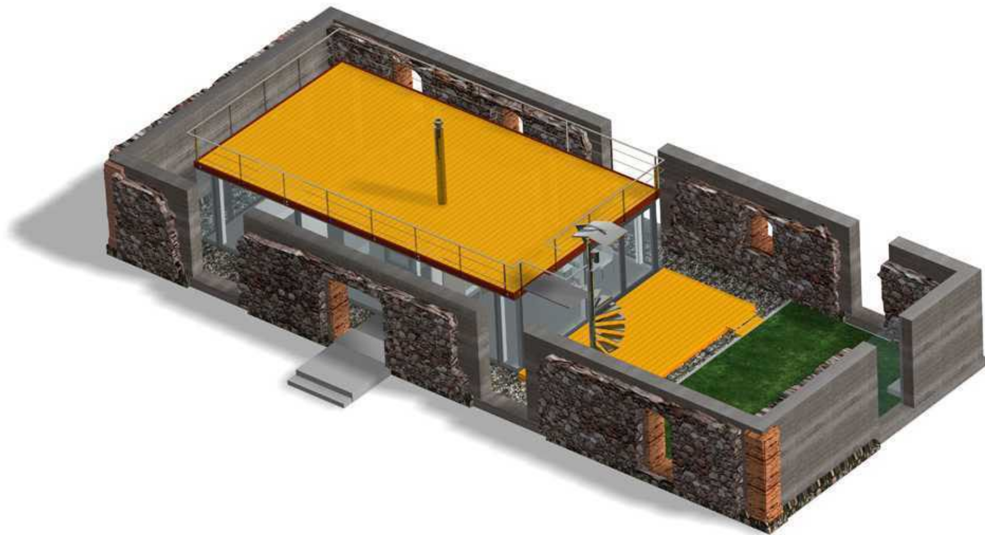
House in the Ruins, Drupas, Latvia. NRJA Architects