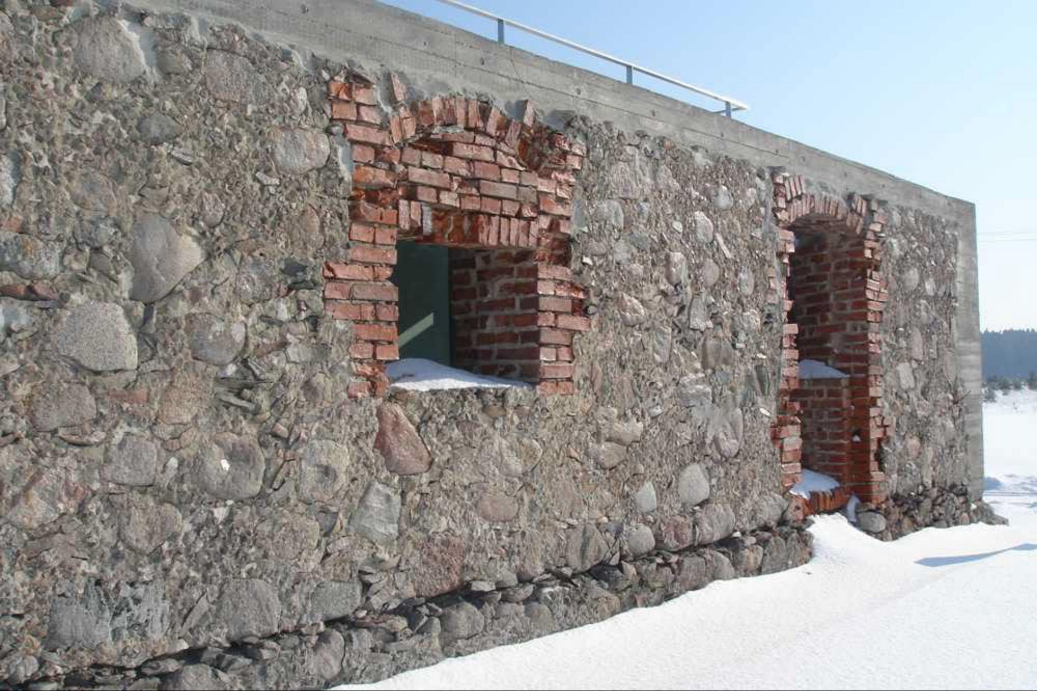
House in the Ruins, Drupas, Latvia. NRJA Architects