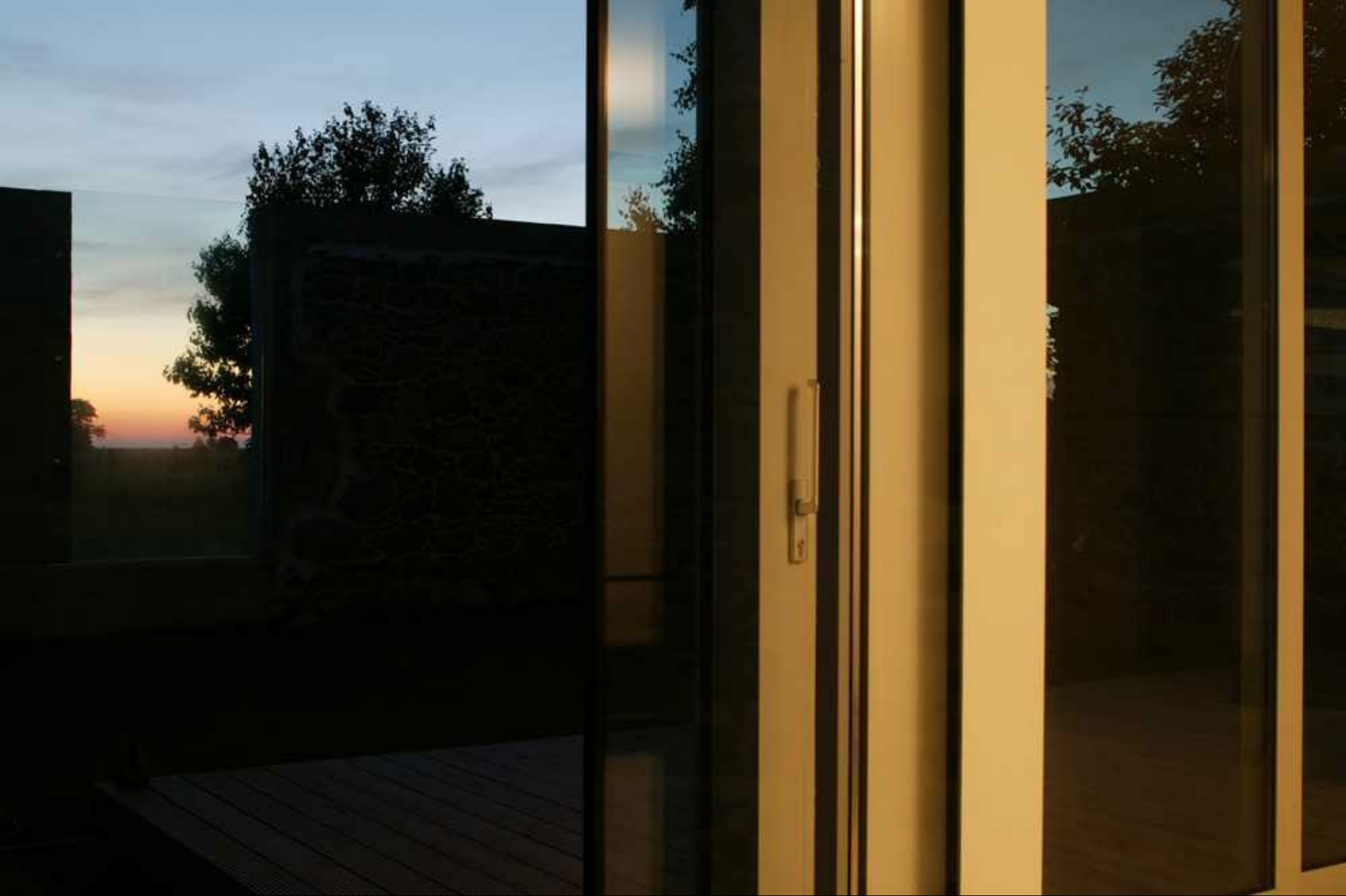
House in the Ruins, Drupas, Latvia. NRJA Architects