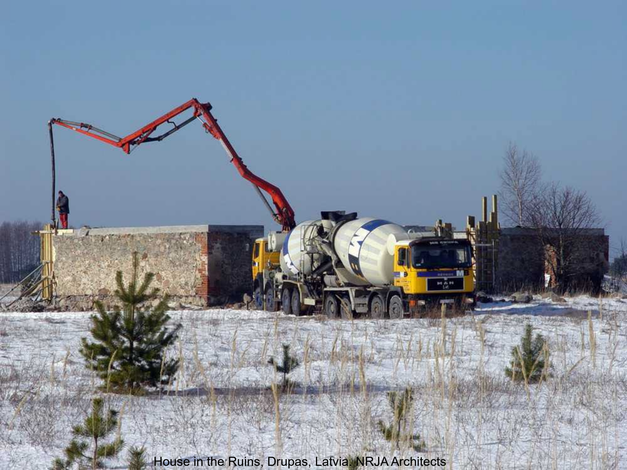
House in the Ruins, Drupas, Latvia. NRJA Architects