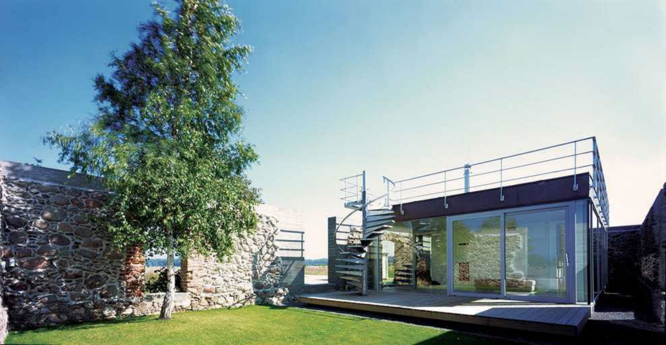
House in the Ruins, Drupas, Latvia. NRJA Architects