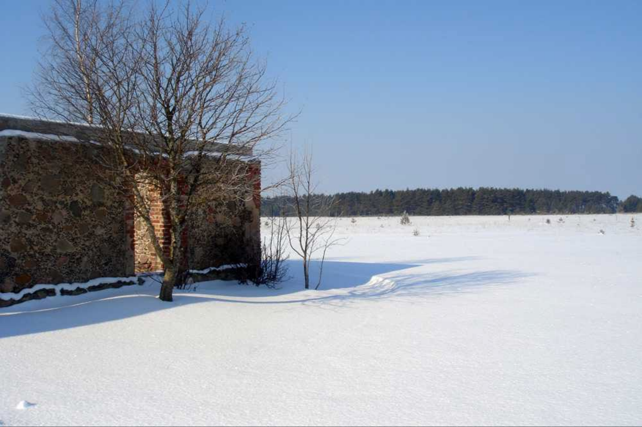
House in the Ruins, Drupas, Latvia. NRJA Architects