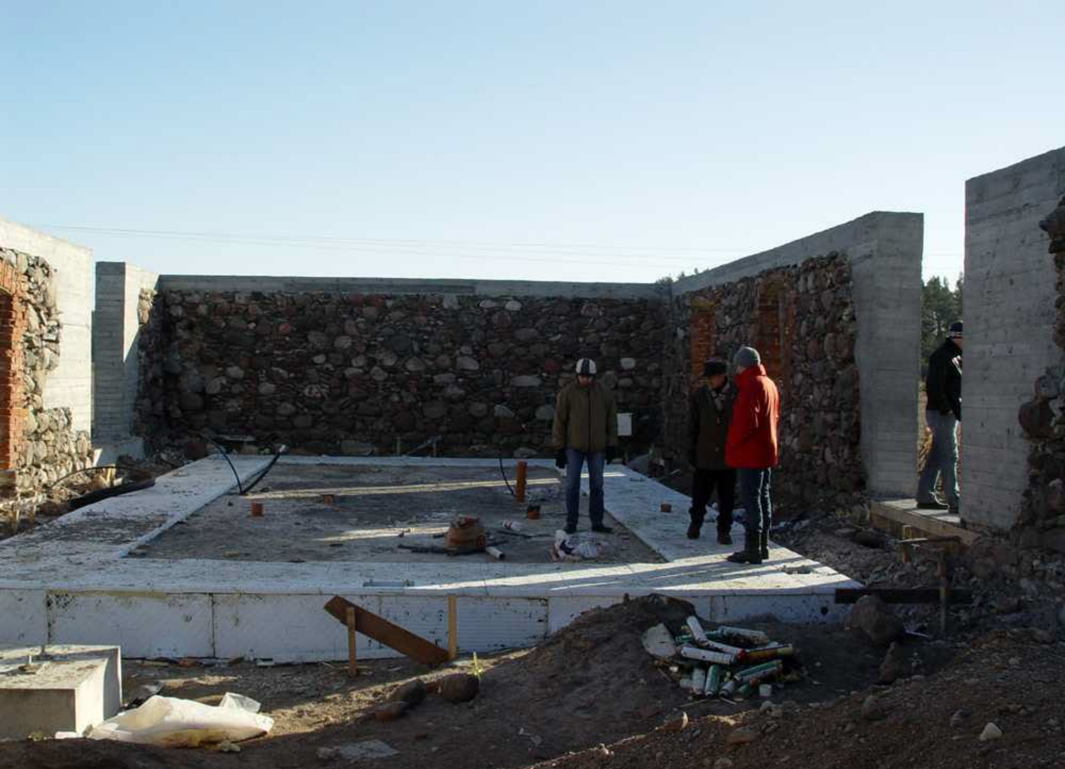
House in the Ruins, Drupas, Latvia. NRJA Architects