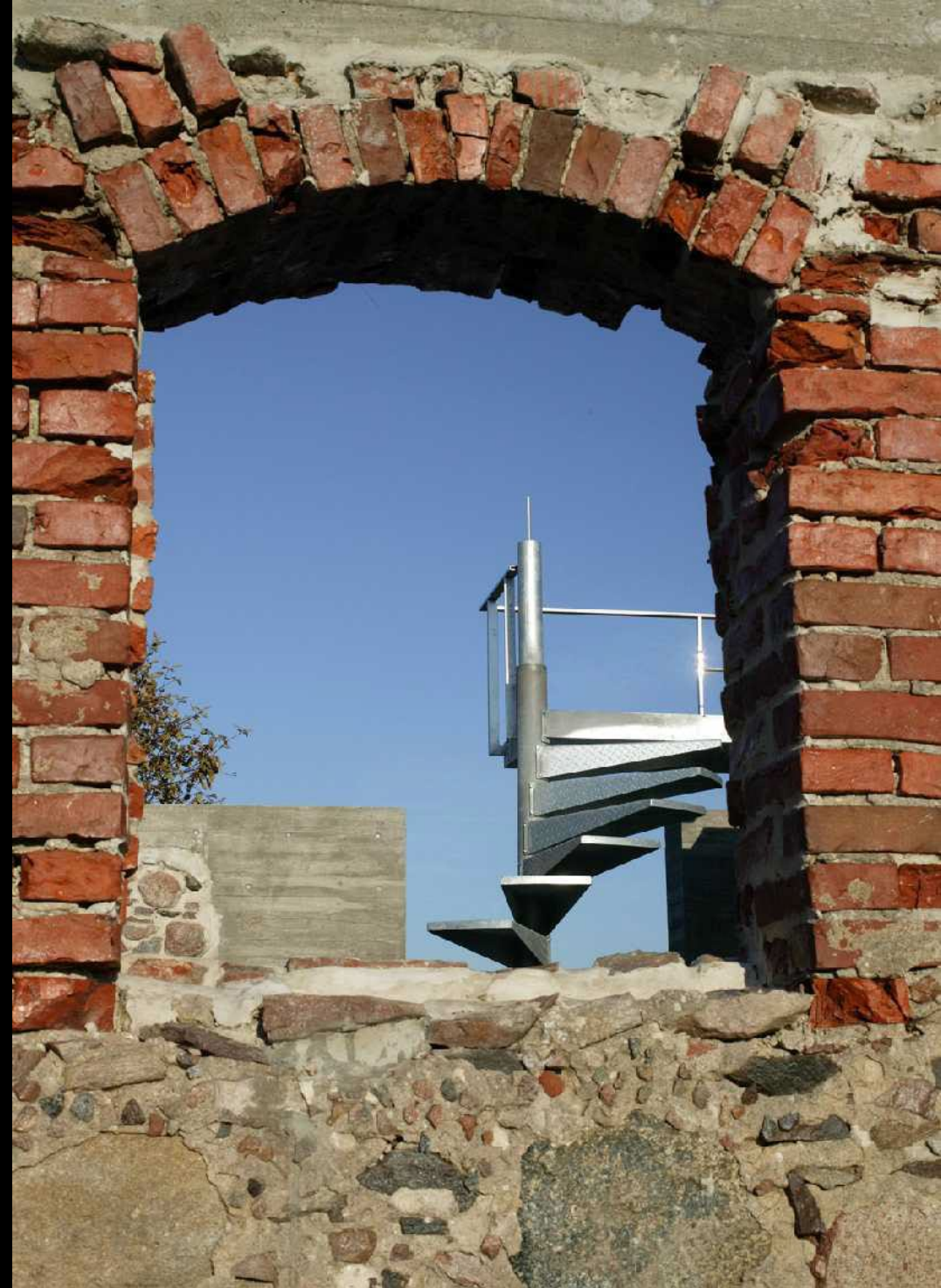
House in the Ruins, Drupas, Latvia. NRJA Architects