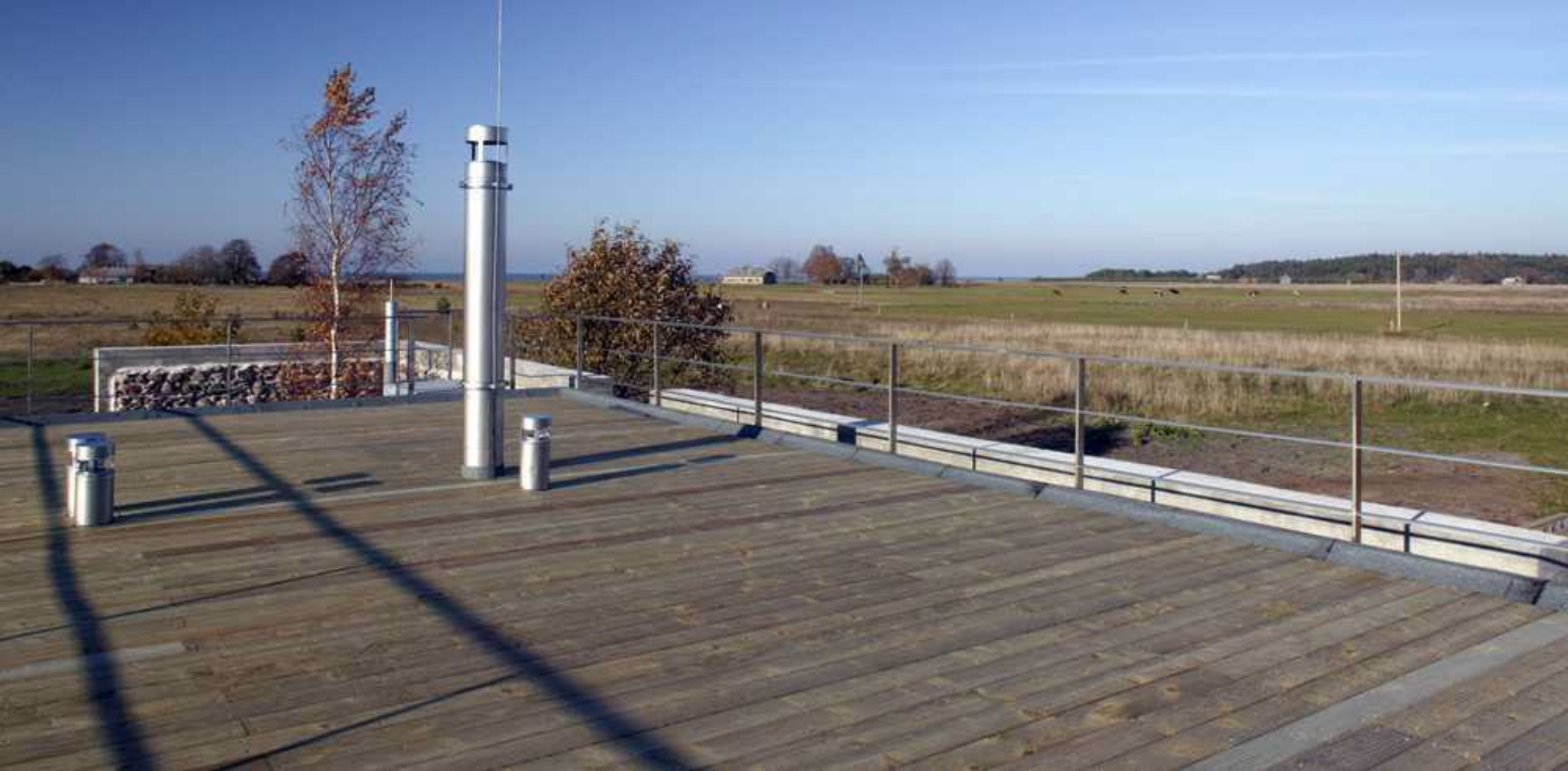
House in the Ruins, Drupas, Latvia. NRJA Architects