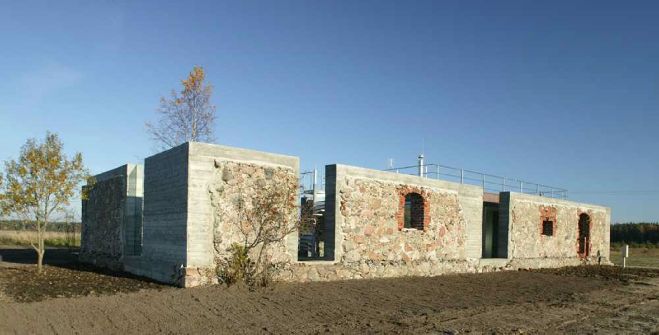
House in the Ruins, Drupas, Latvia. NRJA Architects