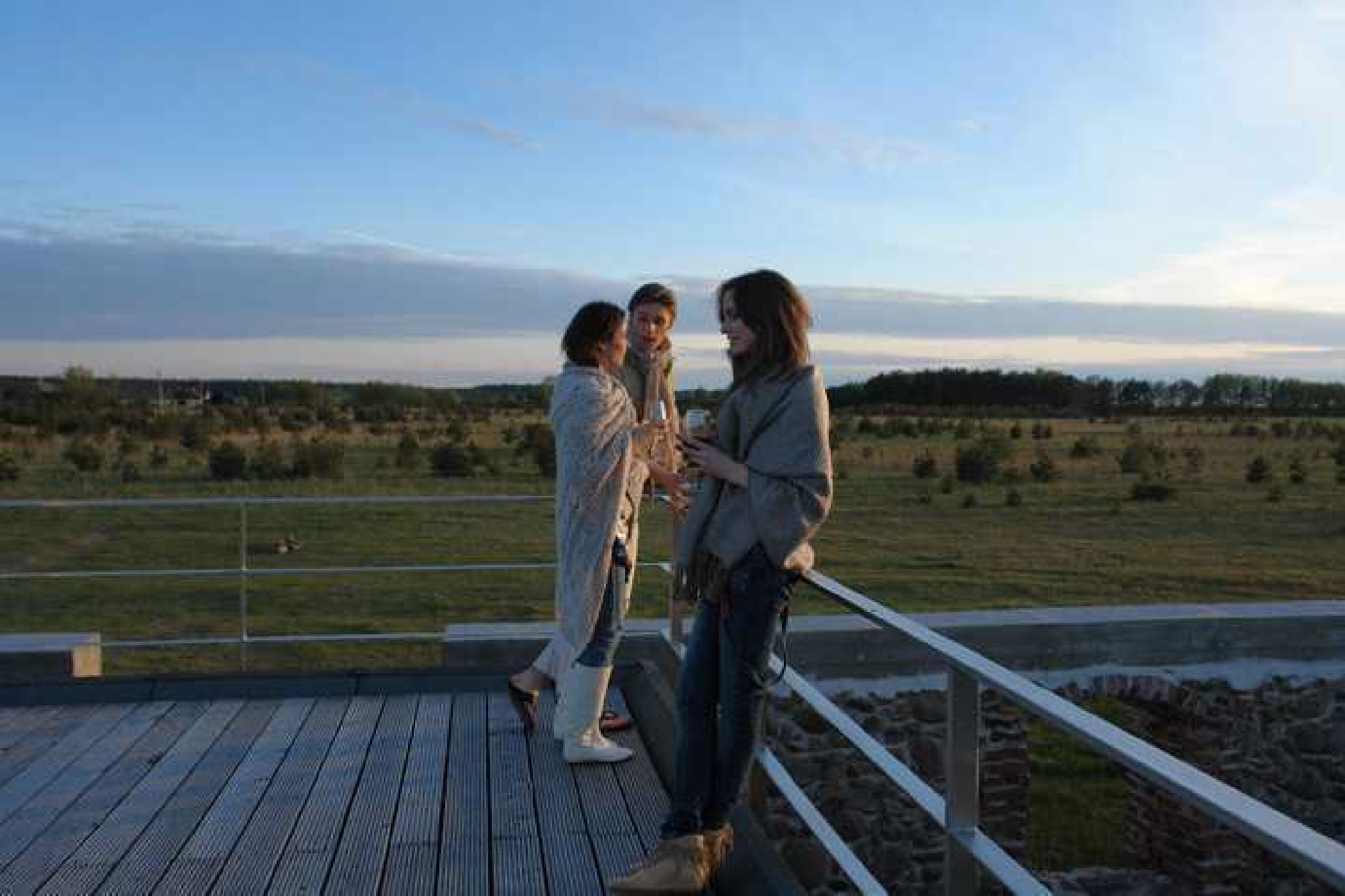
House in the Ruins, Drupas, Latvia. NRJA Architects