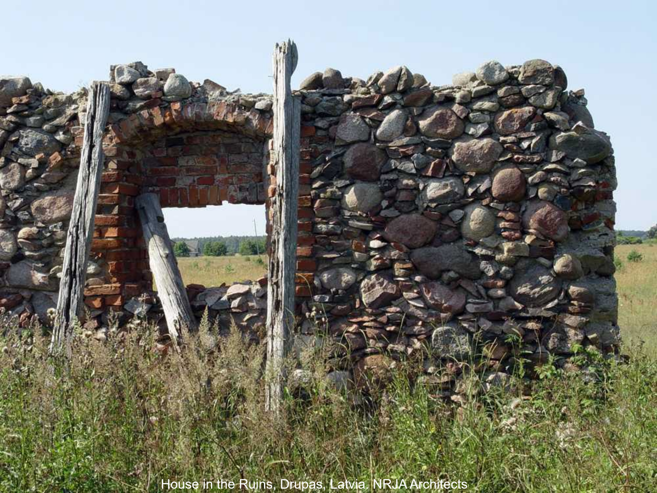
House in the Ruins, Drupas, Latvia. NRJA Architects