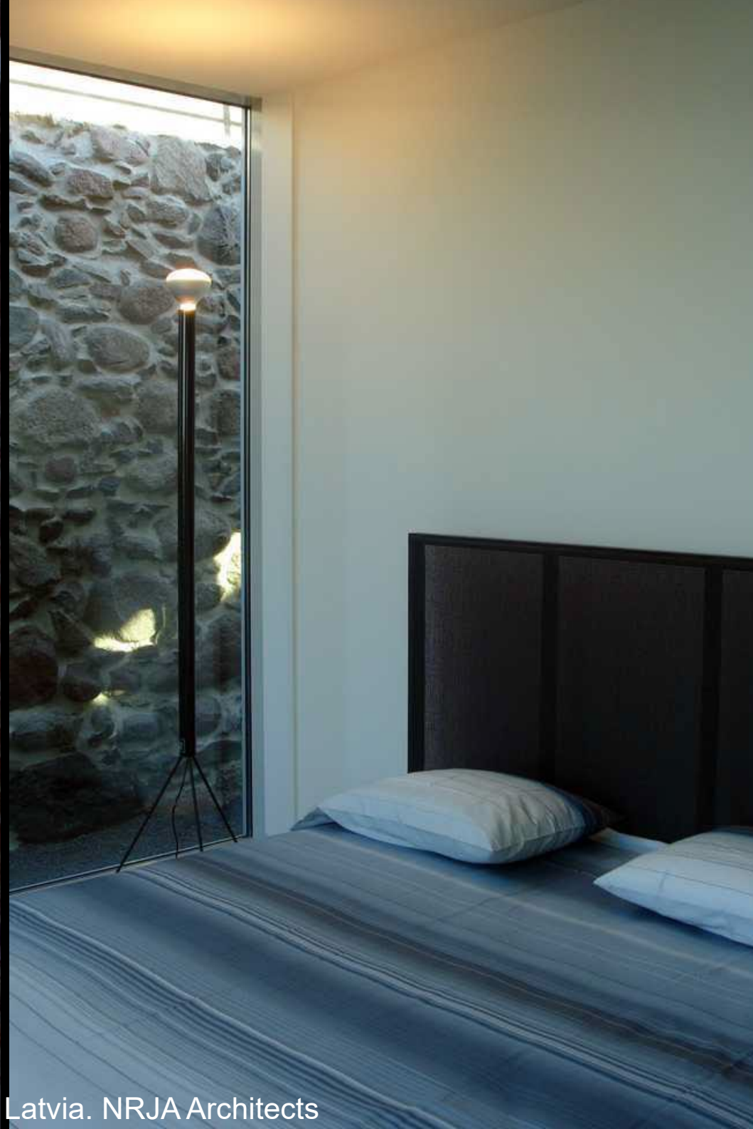
House in the Ruins, Drupas, Latvia. NRJA Architects