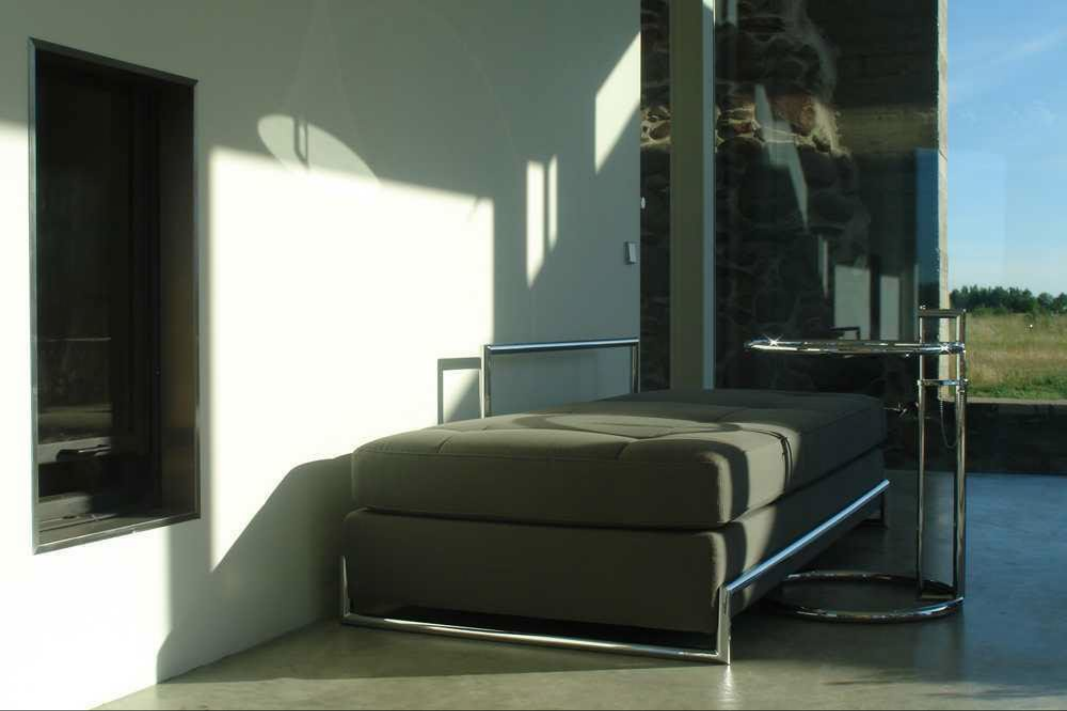
House in the Ruins, Drupas, Latvia. NRJA Architects