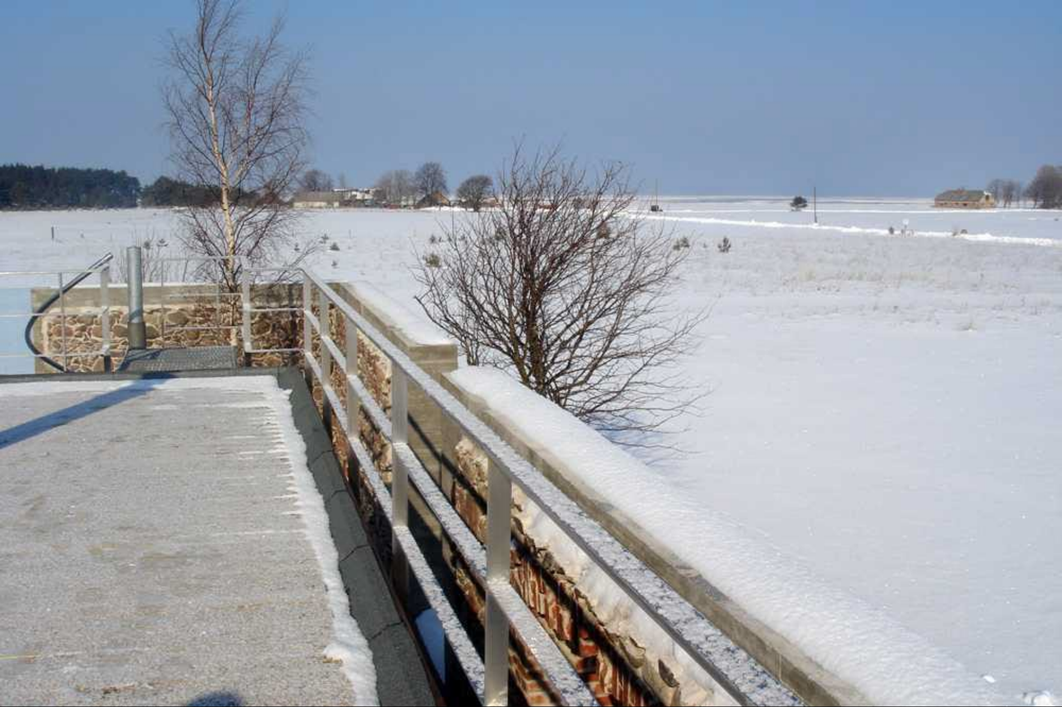
House in the Ruins, Drupas, Latvia. NRJA Architects